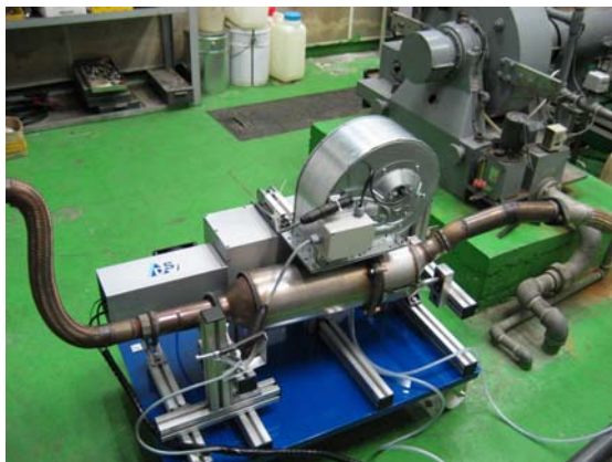
Ash Deposit Monitoring Equipment

A radiation monitoring system is installed close to the ATS. It measures continuously, through the ATS, the radiation emitted by the ashes issuing from combustion of the labelled elements. As the detected signal is proportional to the amount of ashes trapped in the ATS, ash accumulation can be quantified on-line during engine operation.