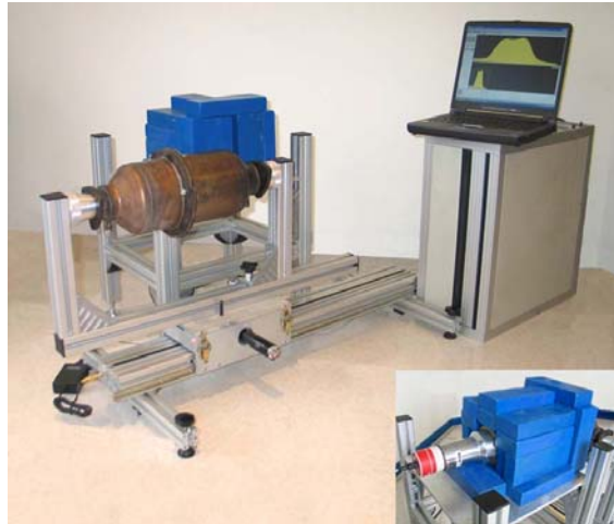
Automatic scanner for measurement of ash distribution profile in ATS

A scanning device is also available for 2D/3D measurement of ash distribution in the ATS. The system is used without dismantling the ATS since the radiotracer signal (gamma rays) passes through the casing.