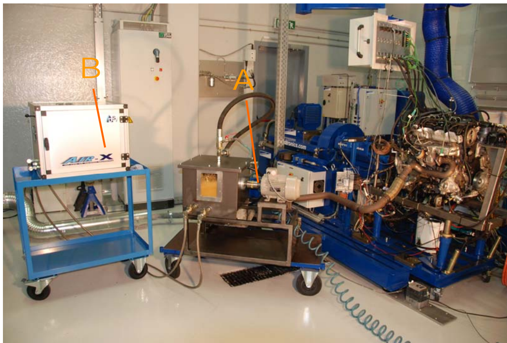
AIR-MIX equipment for supplying aerated oil to an I.C. engine, installed in a test cell